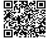
QR code for mobile view

48 hours prior to surgery date, SDS calls caregiver for surgery time, NPO times, and reminder for carbohydrate-rich last PO intake