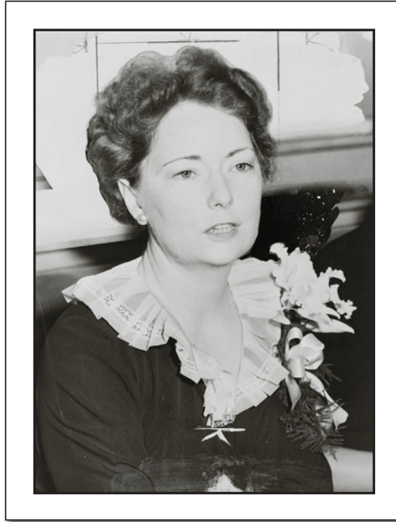
Margaret Mitchell, circa 1941.