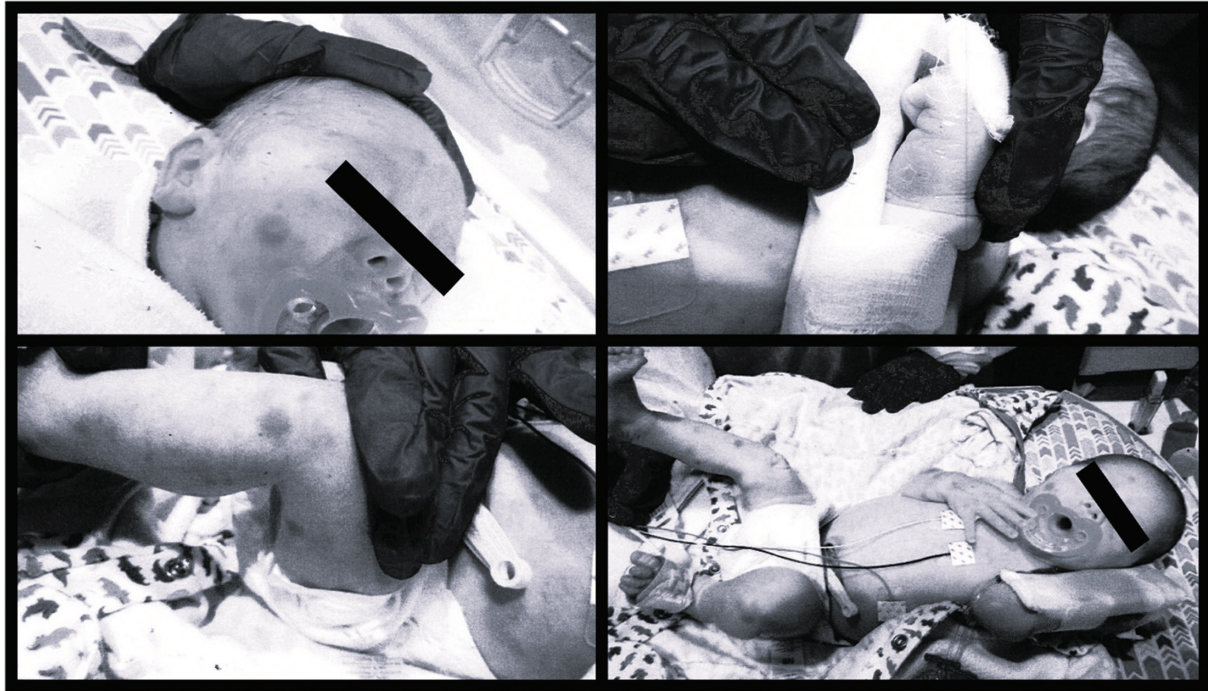
Fig. 1 Photo panel representing appearance of lesions at birth.