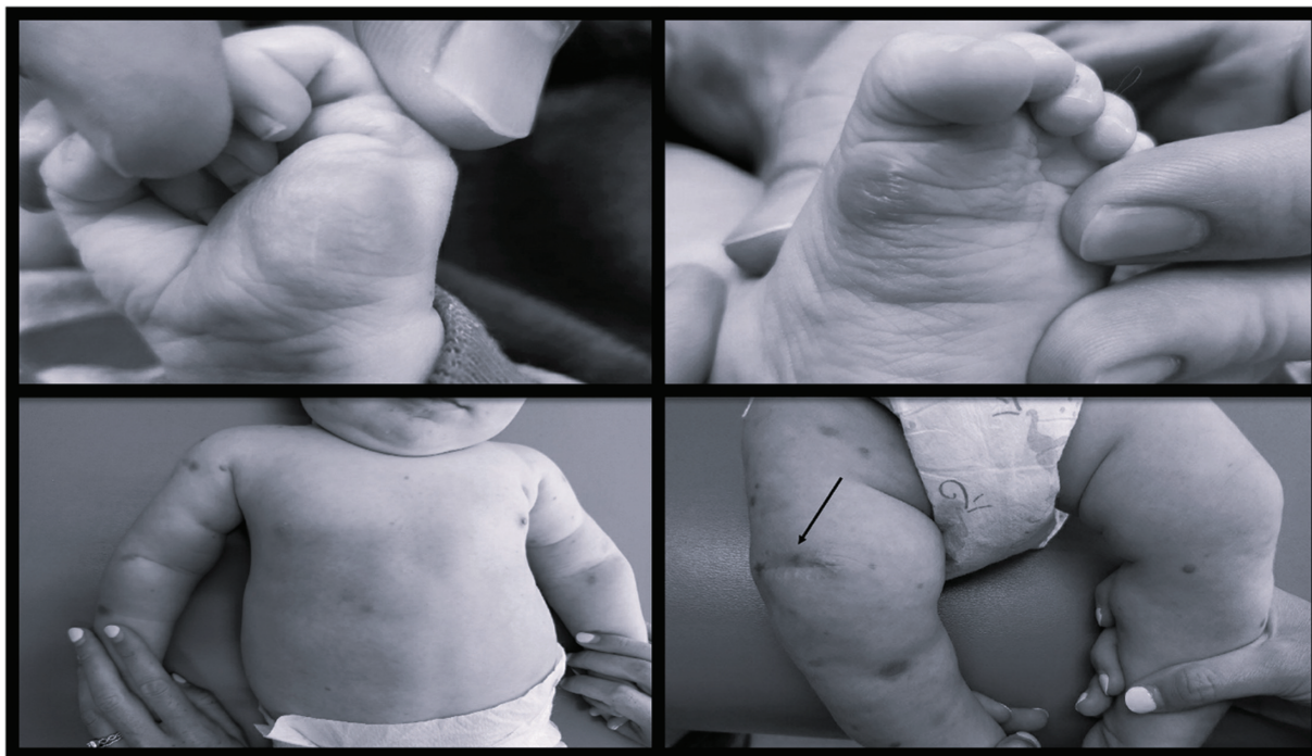
Fig. 3 Top panel represents appearance of hand and foot lesions at 2 months of age and bottom panel represents appearance of lesions at 6 months of age. Arrow points to the site of the biopsy of a large 3-cm diameter lesion on the right distal thigh which revealed the diagnosis.