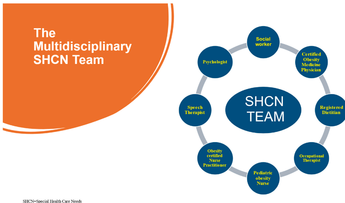
Fig. 2. The multidisciplinary team for the child with SHCN and obesity. (Original Figure).

music intervention to accentuate and develop interest in other areas in infants identified at risk [125].